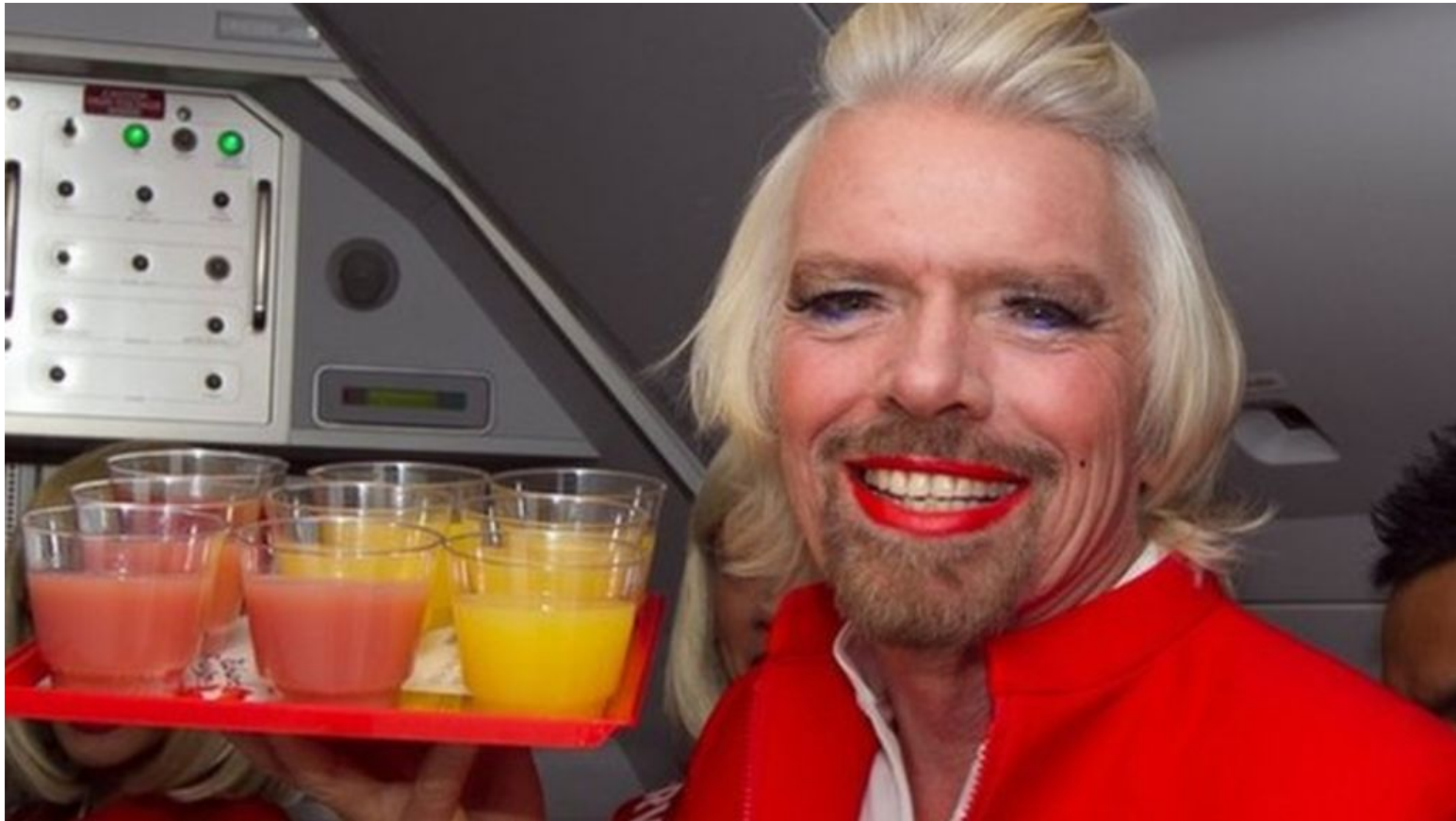
Illustration of an active, dedicated owner's effort to increase market share