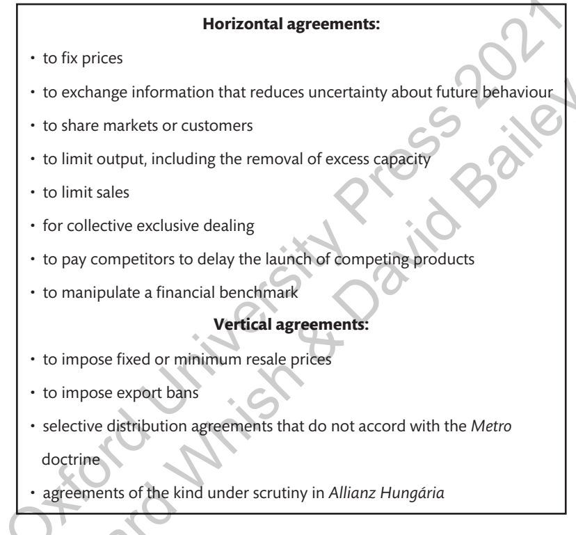
Fig. 3.2 The object box

Following the order of the text earlier, it seems that the contents of the 'object' box can be depicted as shown in Figure 3.2.<sup>541</sup>